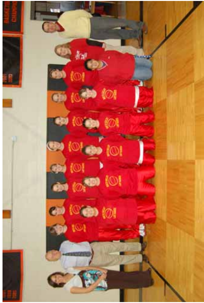
North Shelby Lady Raiders