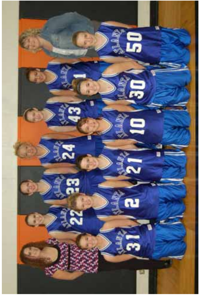
Atlanta Lady Hornets