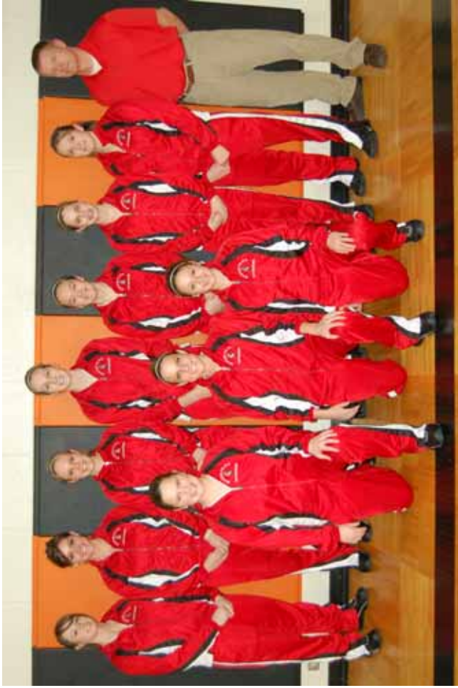
Marion County Lady Mustangs