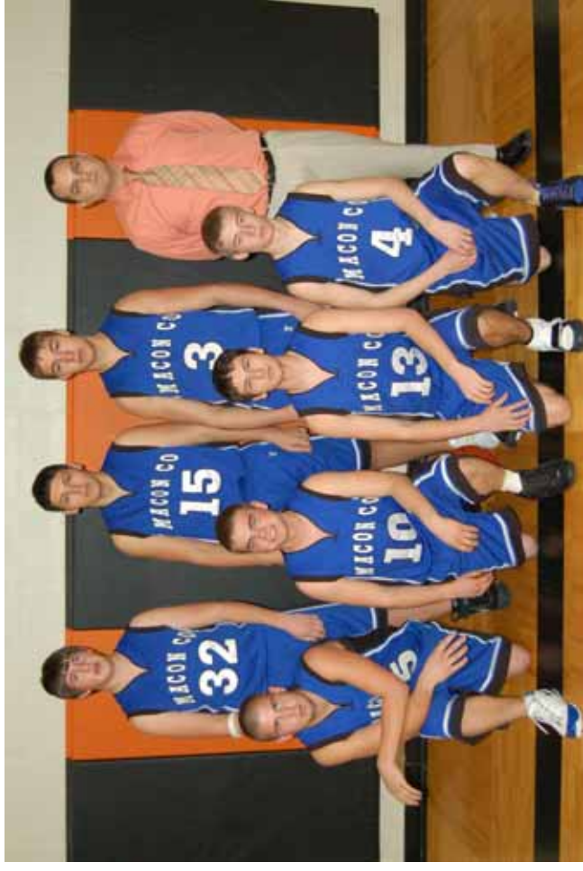
Macon County Raiders