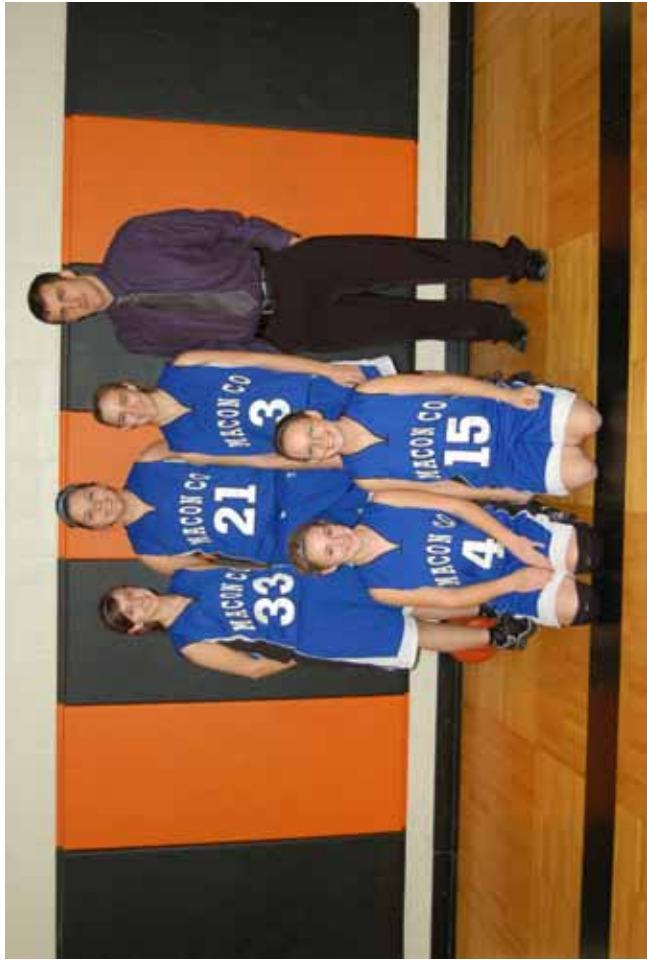
Macon County Lady Raiders