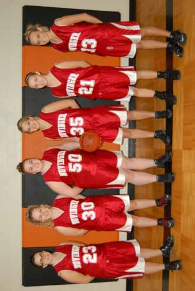
Novinger Lady Wildcats