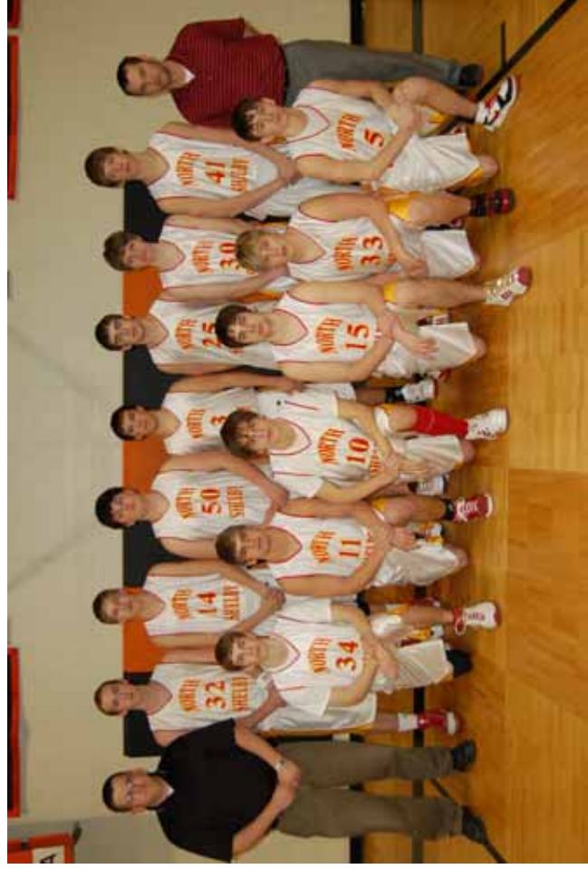
North Shelby Raiders