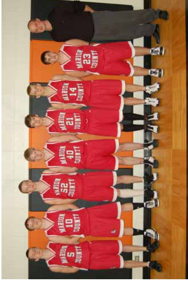
Marion County Mustangs