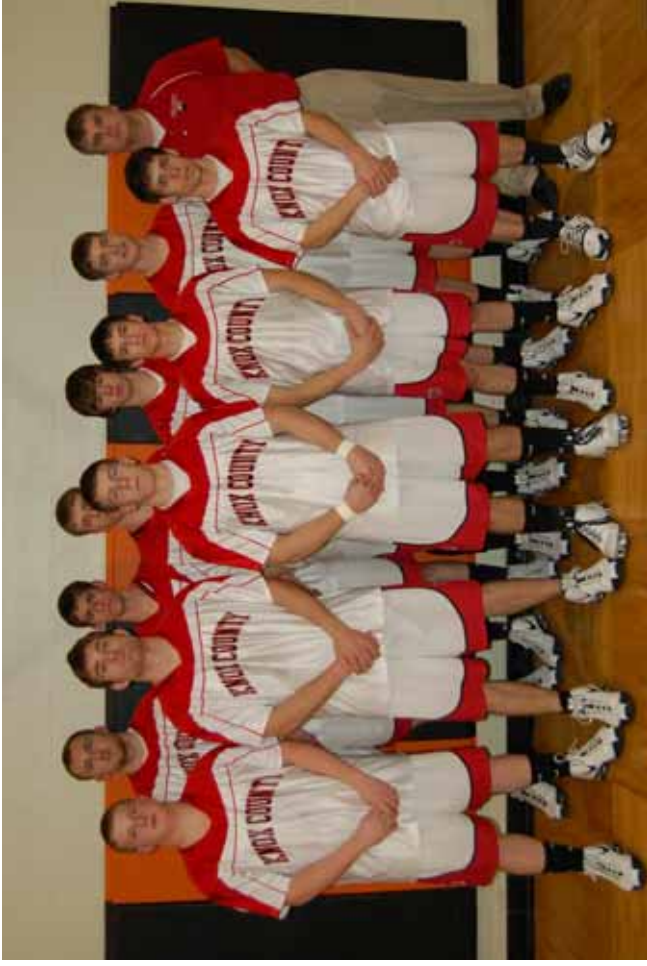
Knox County Eagles