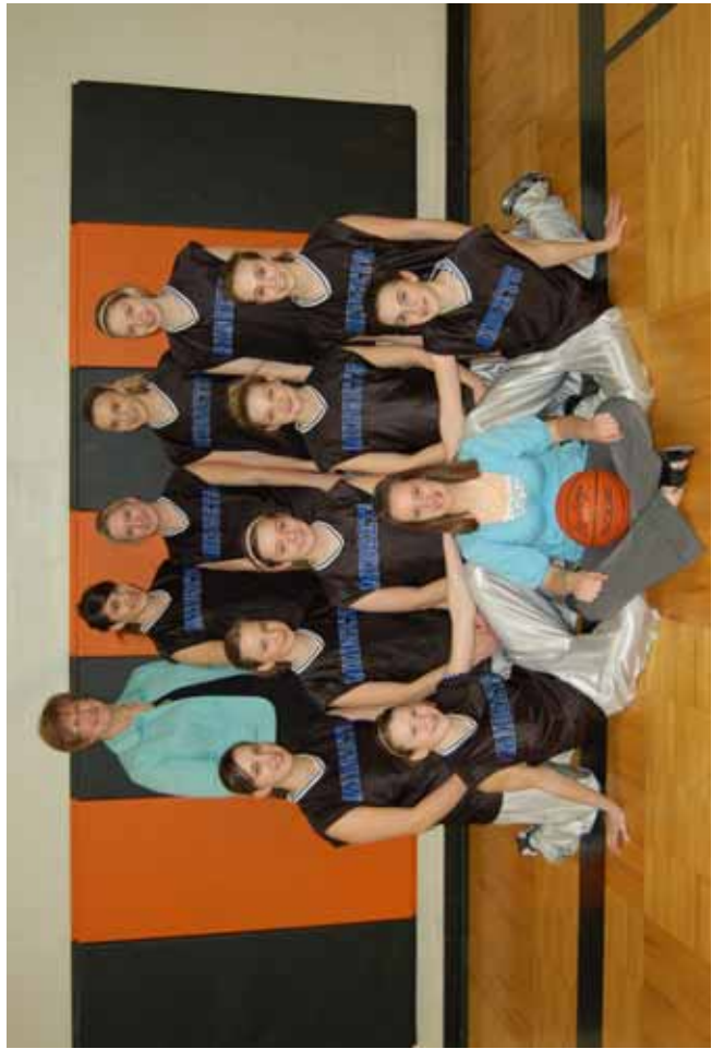
Putnam County JV Lady Midgets