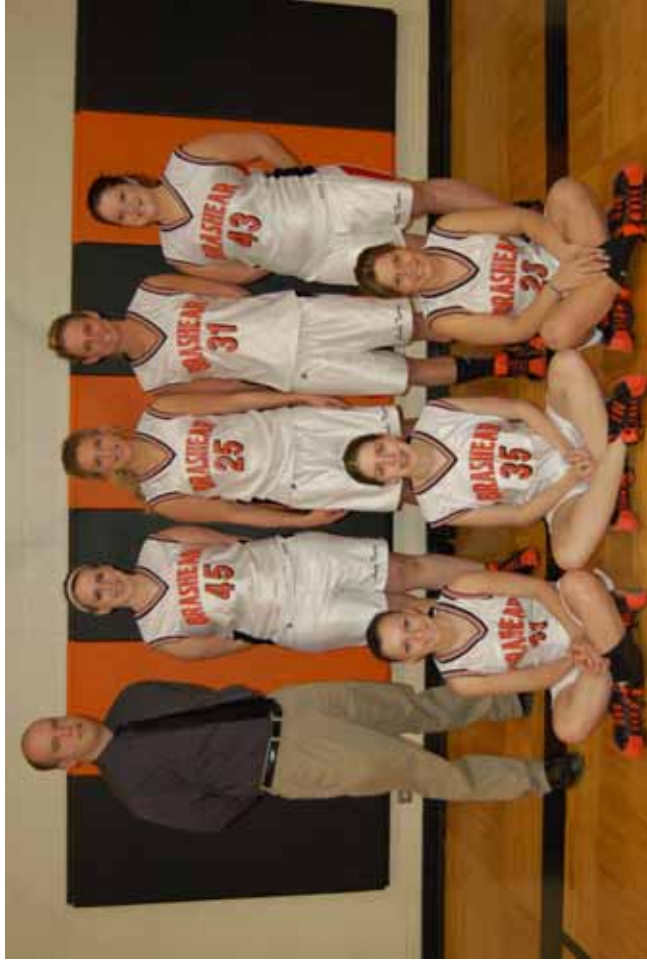
Brashear Lady Tigers