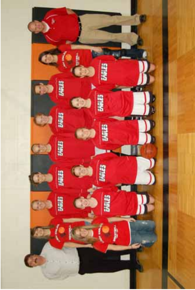
Knox County Lady Eagles