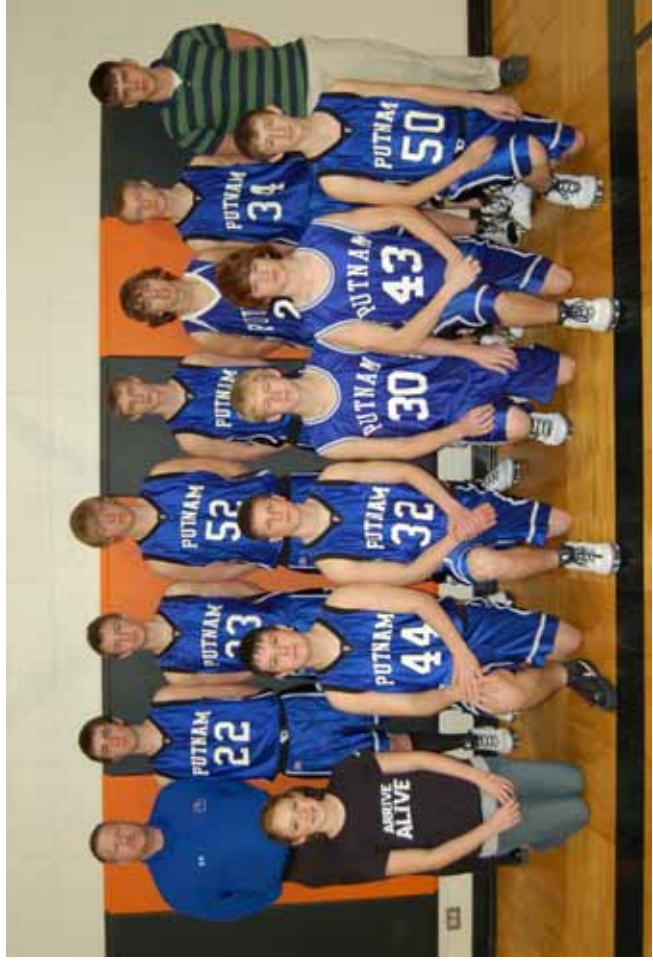
Putnam County JV Midgets